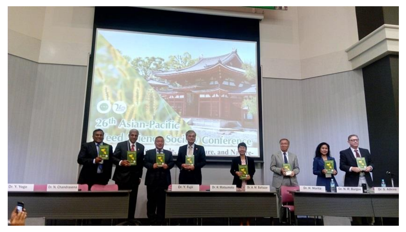
Photo: Launch of "Weed Management in Rice in the Asian-Pacific Region" Book at the Kyoto Conference.