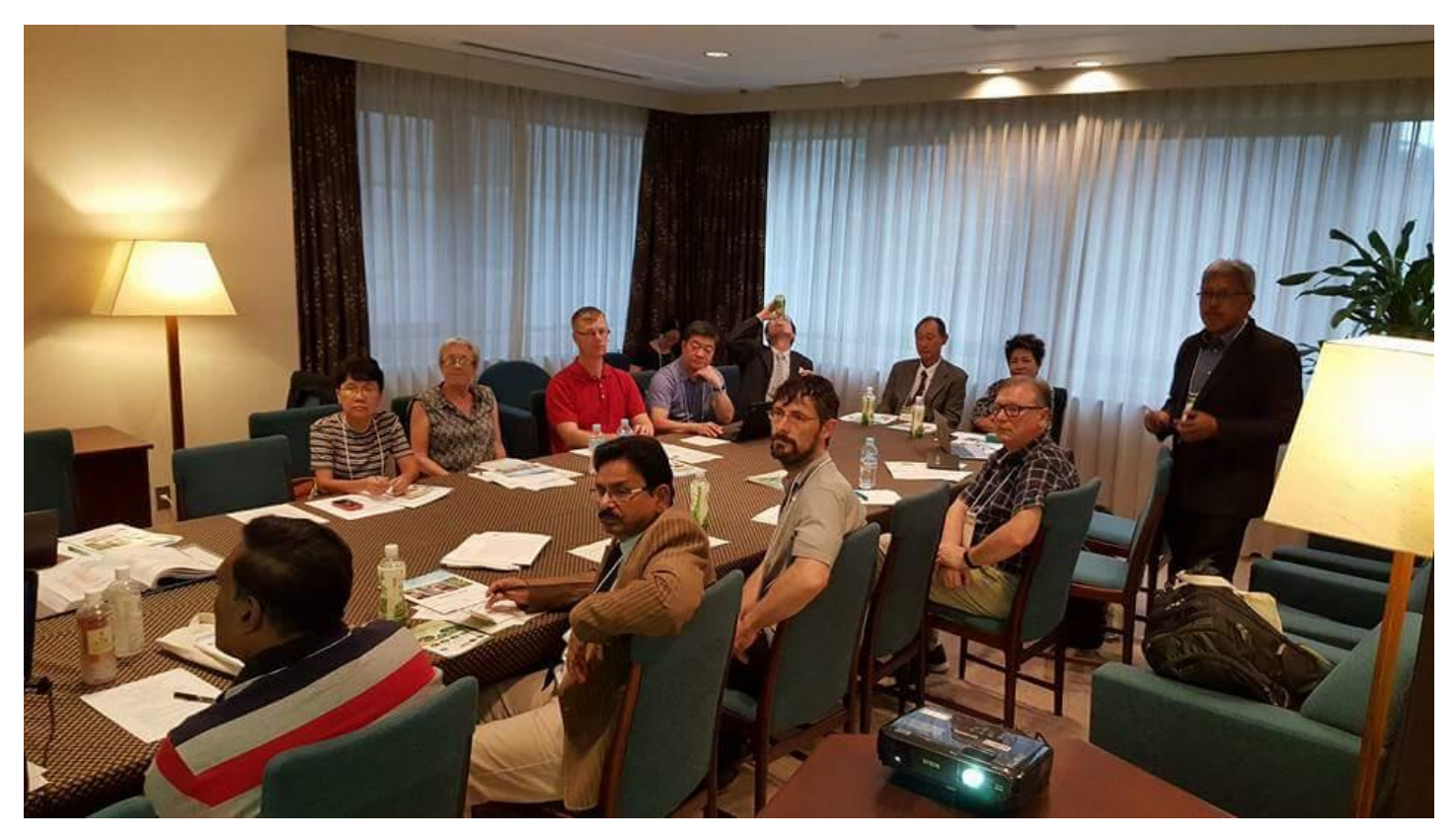
The APWSS Executive Committee Meeting in Kyoto, Japan