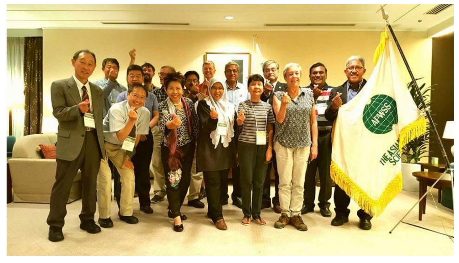
The new APWSS Executive Committee in Kyoto, Japan